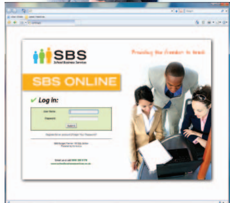
SBS Online Login Screen